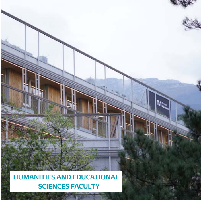
HUMANITIES AND EDUCATIONAL SCIENCES FACULTY